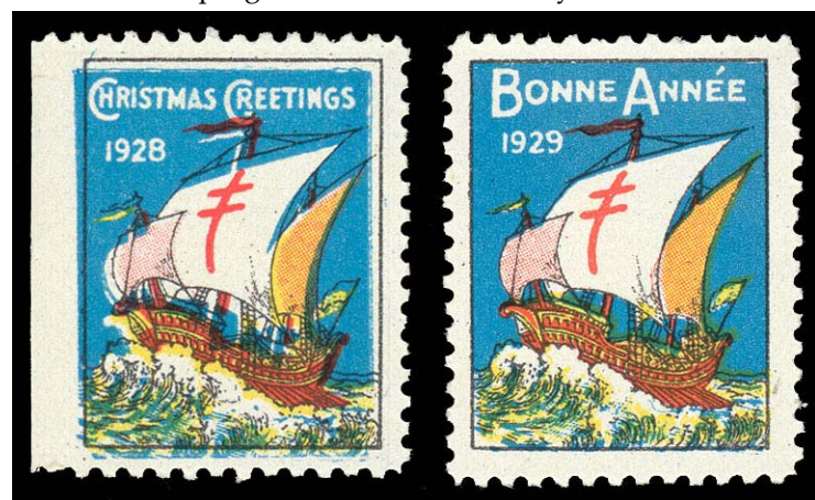
Canada 1928 & 29 Bilingual