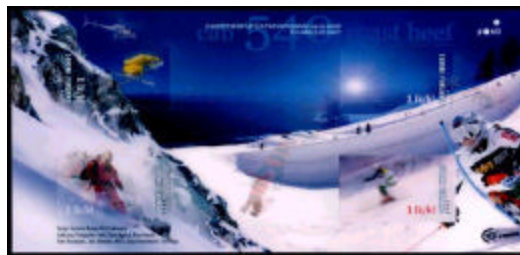
Canadiens in 2009.

Also in 2008, they produced the souvenir sheet below using the lenticular technology featured on Canada Post's tribute to the 100 th anniversary of the Montreal